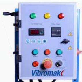
Electrical Control Panel