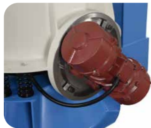
Adjustable Motor Position